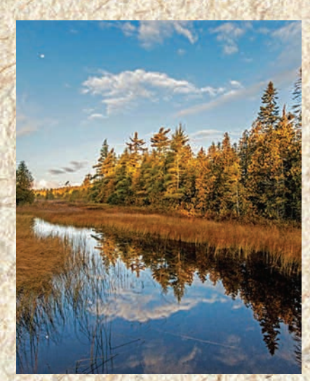
RIDGES LITES Fall 2017, Vol. 10 Issue 4